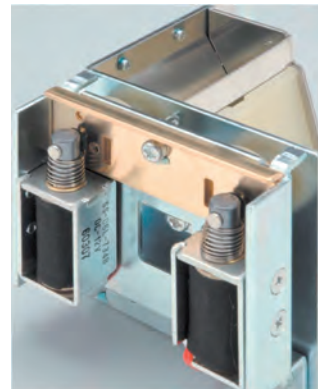
Model ARM-5000 (back)